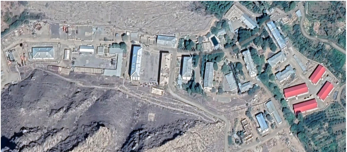
The local FSB headquarters near Meghri. (The red roof buildings were built between 2021-2023)