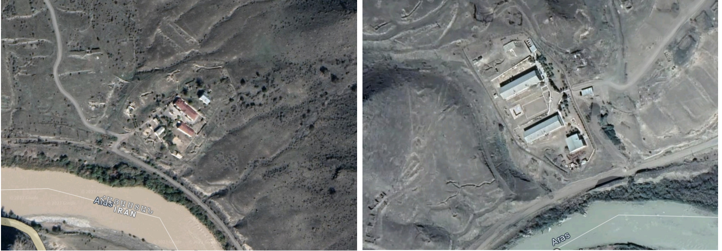
Left: The Russian 016 military outpost near the eastern Armenia-Azerbaijan-Iran triangle.

At the western end of the Armenia-Azerbaijan-Iran triangle near Nakhichevan, the Russians operate another (unknown number) military outpost (38.843502, 46.156743). This military site is currently under construction, or expansion, and will establish Russian control over the 3 kilometer borderline between Armenia and Nakhichevan.